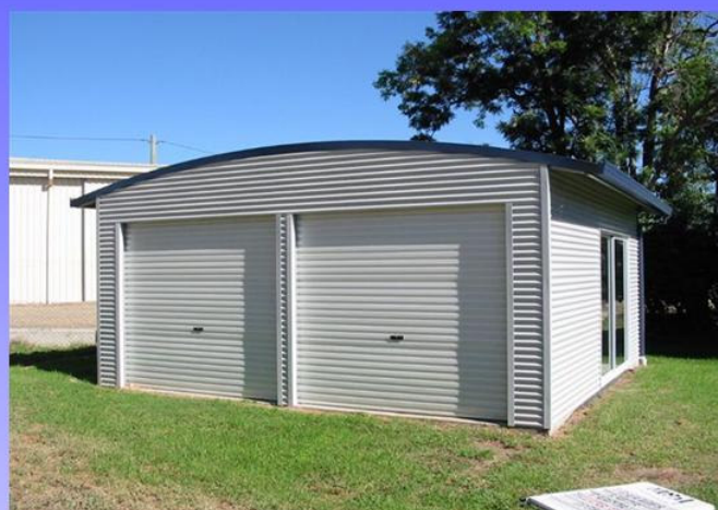
Spans from 3.6m to 7.2m, and lengths are virtually limitless.

Awnings, Glass Sliding Doors, PA Doors, Windows and Vents are all available inclusions. Combining style, practicality and strength the Curved Roof Range is perfect for any application whether its Rural, Residential or Commercial.