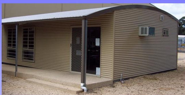
Standard height of 2.7m allowing for 4WD access

AllGal Garages and the Williams River Steel Group are proud to bring you The Curved Roof Range. Constructed from a 1.2mm steel stud wall frame @ 600mm centres and C section roof purlins, the Curved roof design is ready to be fitted with nearly any internal lining. Custom Orb sheeting is standard on the roof and walls, with alternative wall claddings available.